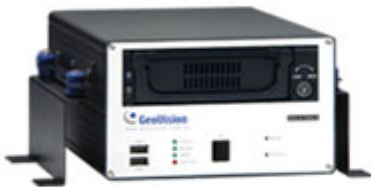
GV-LX4C3V (ACC Model)